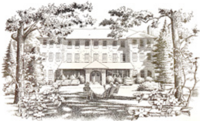
Original sketch of the The Monte Vista by Walter S. Dougherty